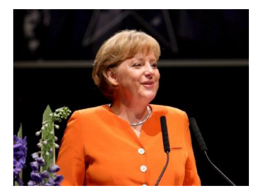
...more and less famous Oranje fans

The fertile soil and the Polder grasslands have made the Netherlands one of the world's largest producers of diary products (with uncountable flavors of cheese), vegetables, fruits and flowers. Agriculture accounts for 21 % of the nation's export value and the country is the second largest exporter of agricultural products, only topped by the United States. Nevertheless, the brand names of Dutch industry (Philips, DAF trucks, Fokker aircraft, Royal Dutch Shell, Heineken) and finance (ABN-AMRO, ING, Randstad) also resound worldwide.